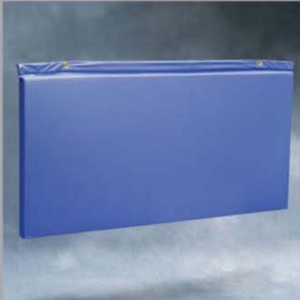
ArtEx Clean Baffles