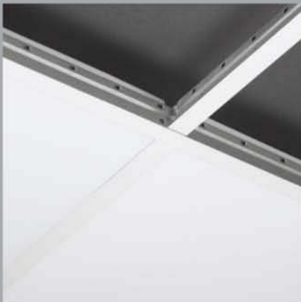
ArtEx Ceiling Tiles